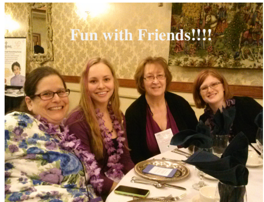
Fun with Friends!!!!