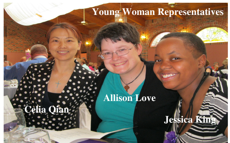
Young Woman Representatives

W elcome, I will be there to help you along your journey! These are the words we should be saying to our new leaders. Build them up to know they can accomplish all tasks set before them. And, give them your prayers of thankfulness that they have taken on the great responsibility of supporting missions and encouraging growth of the LWML. Pray for their relationship with God that through this they will be great spiritual leaders for all of us.▶