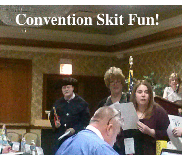
Convention Skit Fun!