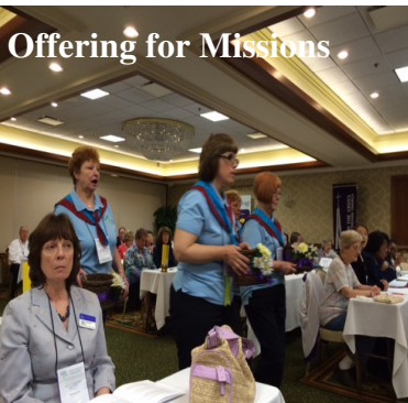
Offering for Missions