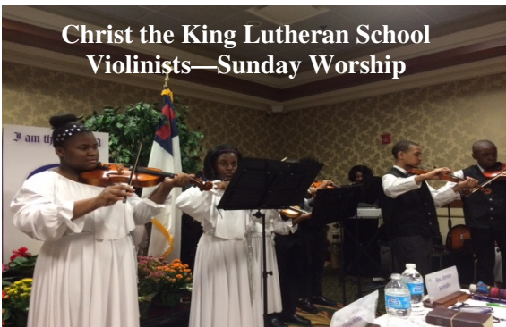
Christ the King Lutheran School Violinists—Sunday Worship