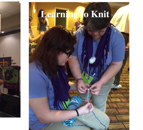
Learning to Knit