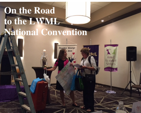
On the Road to the LWML National Convention