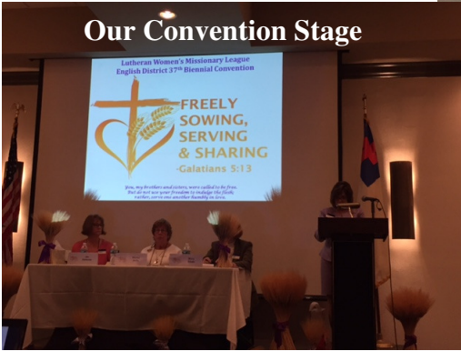
Our Convention Stage