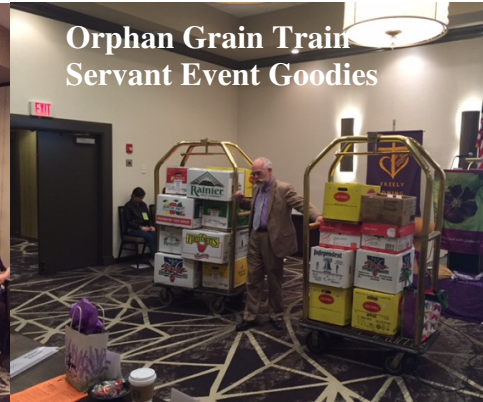
Orphan Grain Train Servant Event Goodies