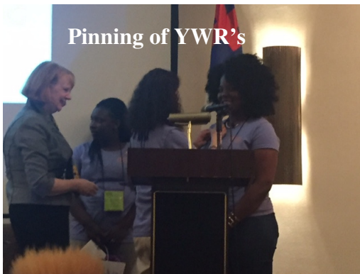
Pinning of YWR's