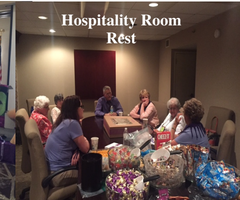
Hospitality Room Rest