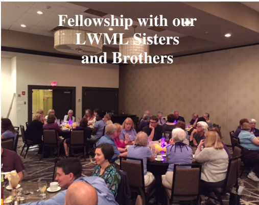
Fellowship with our LWML Sisters and Brothers