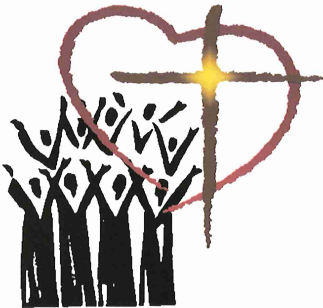
O Lord, open my lips and my mouth will declare your praise. Psalm 51:15