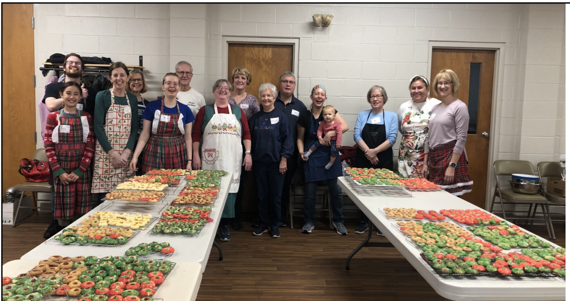
The LWML of Calvary Lutheran Church in Mechanicsburg, PA, in early December baked 114 dozen cookies .

To receive a copy of the ACCENT by email send your email address to cactuslwml@gmail.com . This list is only used for distribution of the ACCENT. When emailing every effort is made to keep the list secure.